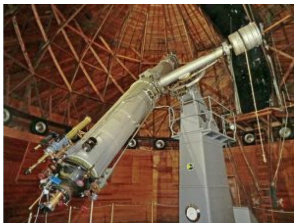
Figure 2. Vesto Slipher (1875–1969) and the Clark 24" Refractor at the Lowell Observatory in Flagstaff, Arizona.

As the 1920s unfolded there were exciting developments in both observational astronomy and relativistic cosmology [11, 12, 13, 20]. Astronomers recognized that the spiral nebulae are very distant objects external to the Milky Way galaxy. Further spectroscopic work by Edwin Hubble and Milton Humason at Mount Wilson established that there is a linear relationship between distance and redshift, a result presented in 1929 in a famous paper [8]. Meanwhile researchers in relativistic cosmology devised various geometric models, “invented universes” in the words of one historian [10]. In 1922 the Russian mathematical physicist Alexander Friedmann published a geometric model of an expanding universe. Although Friedmann did not refer to contemporary astronomical work, it is important to note that he cited writings by the Dutch mathematical astronomer Willem de Sitter and English astrophysicist Arthur Eddington in which Slipher’s observations were discussed. Later in the decade Georges Lemaître developed mathematical models similar to Friedmann’s, but he presented them as actual physical descriptions of the universe.